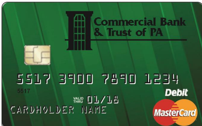
Consumer Debit Card