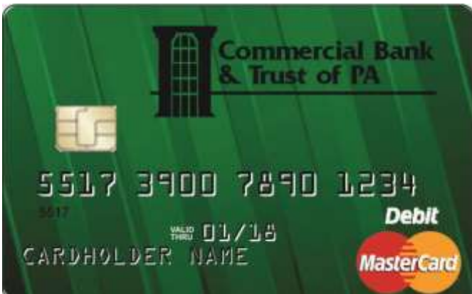
Consumer Debit Card